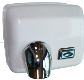
REF 8 11 342 Ouragan manual, white

Automatic hot air hand dryer with 360° orientable nozzle and anti-vandalism steel cover. 2-year warranty.