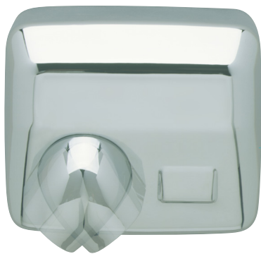
REF 8 11 378 Ouragan automatic, chrome