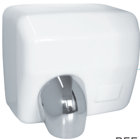
REF 8 11 341 Ouragan automatic, white